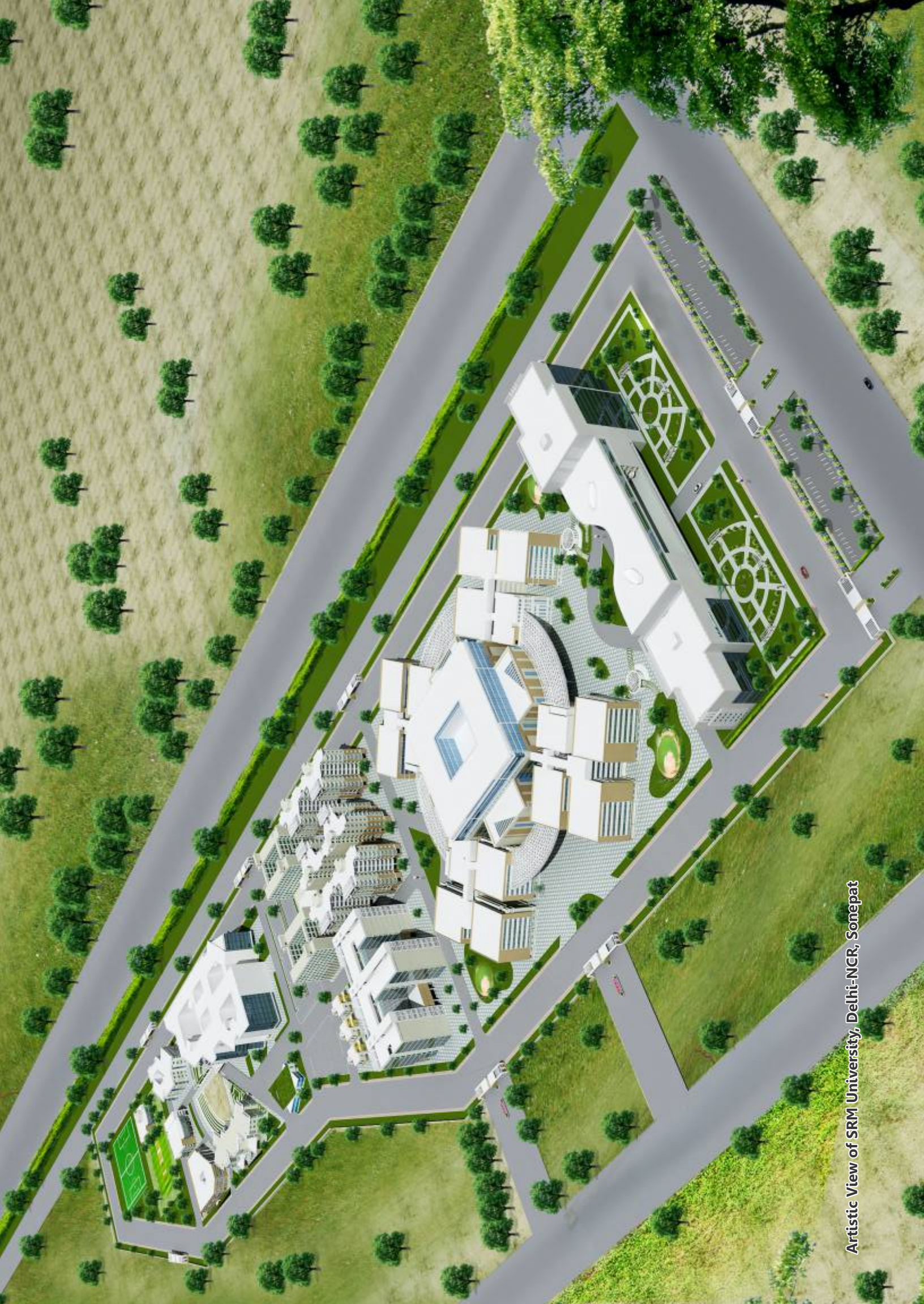
Artistic View of SRM University, Delhi-NCR, Sonepat