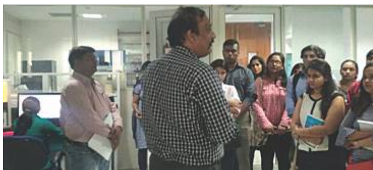
An official educating the students