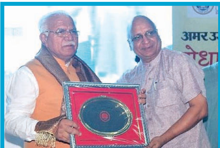
Hon'ble Vice Chancellor felicitating Hon'ble Chief Minister