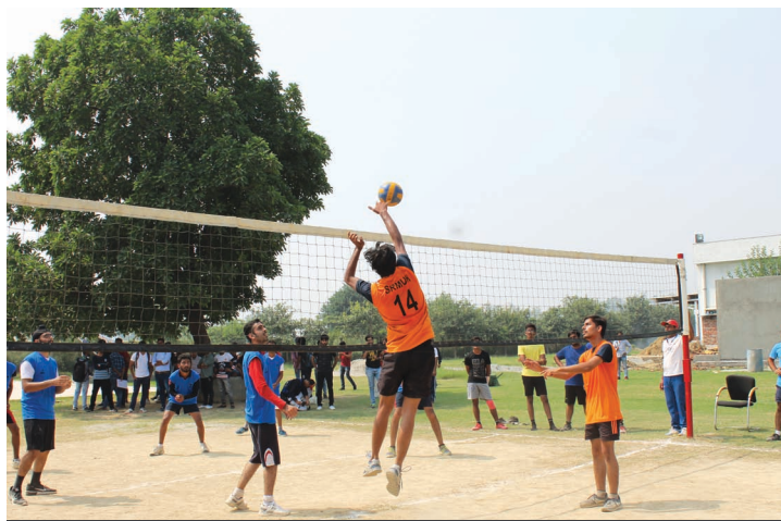
Volleyball in full-swing