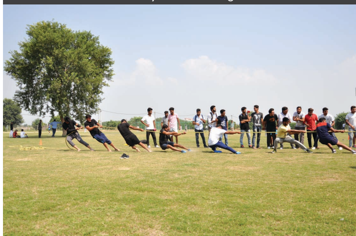
Tug of War in a test of strength