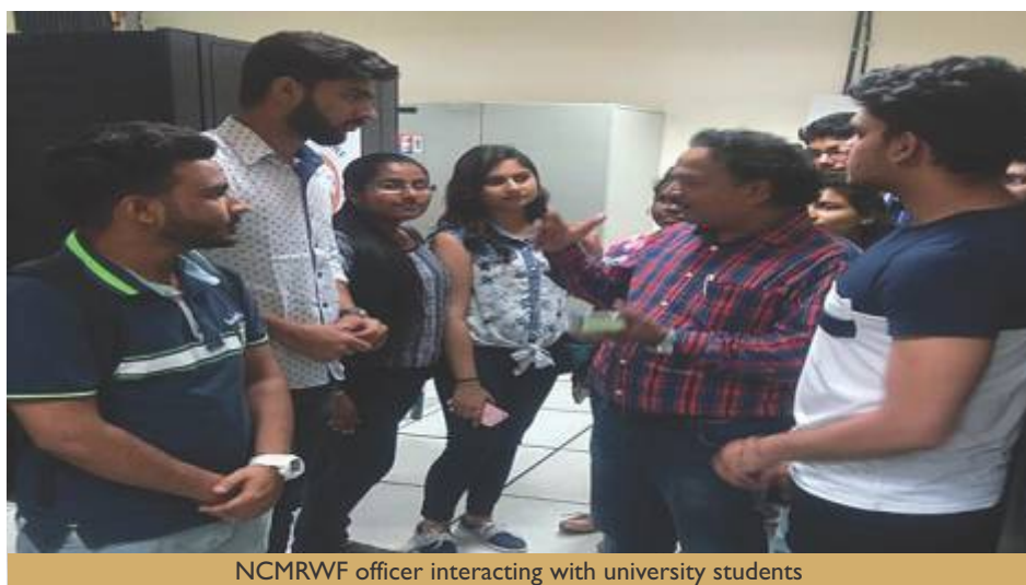
NCMRWF officer interacting with university students