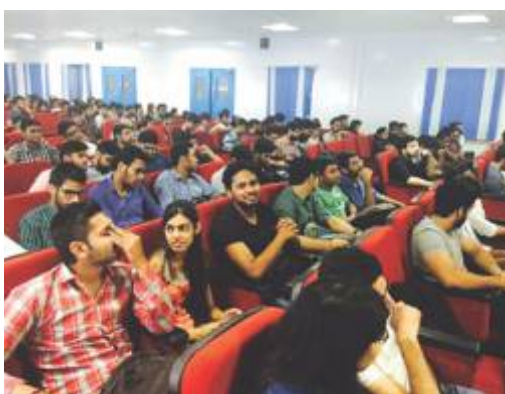
University students attending the seminar

T ata Consultancy Services (TCS) Ltd. conducted a seminar and an online test—TCS Testimony 2017 & Code Vita in the university computer lab on May 11, 2017 for internship/placement opportunity in TCS. About 200 students of the university attended the seminar and thereafter appeared in the test with great enthusiasm.