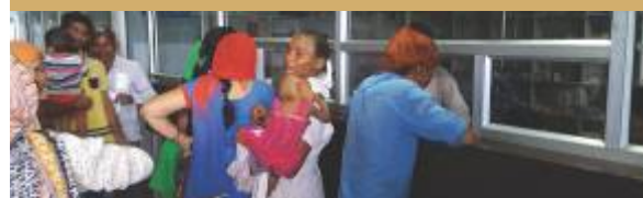
Patients getting free medicines from Jan Aushadhi Medical Store