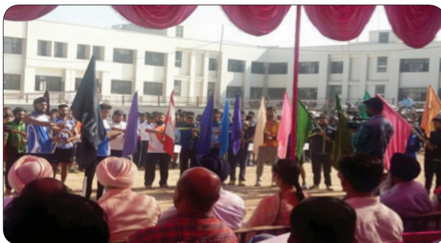
Inaugural programme of AIU, Volley Ball tournament-2016 at Punjabi University, Patiala