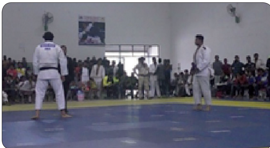
Our Judo Player in action at Kurukshetra University, Kurukshetra

category and first bout against LNIPE, Gwalior and won. His second Bout was with HN Gujrat University which took him to quarter final. In his 3rd bout which was quarter final was with Delhi University candidate who was one of the last year top 8 candidate with whom he showed wonderful skills against and gave tough fight to his opponents.