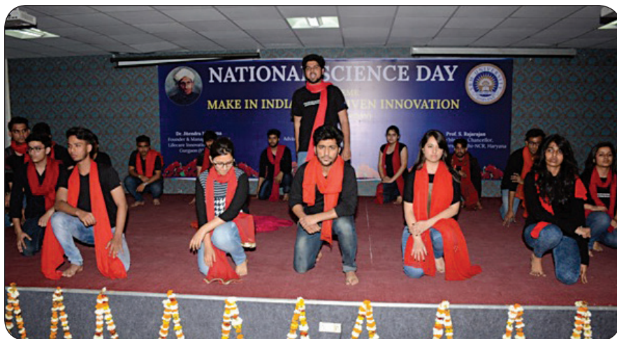
Student skit on Swatch Bharat on NSD

three decades, including his days (more than 15 years) in United States, and was awarded 'Vigyan Ratna' title by both Uttar Pradesh and Haryana governments for his achievements.