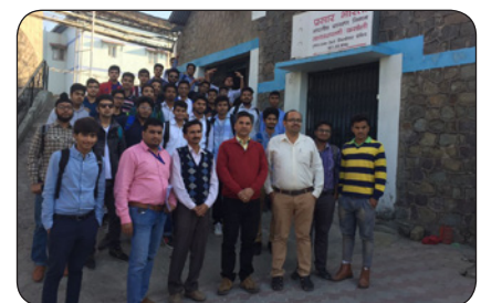
View of our CSE students at Prasar Bharati Doordarshan, Kasauli (H.P.)