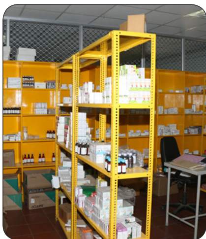
A view of the Jan Aushadhi Medical Store & Hospital

University runs its free OPD day care services in PRIMSR hospital since 2014. Hospital has various facilities for hundreds of people