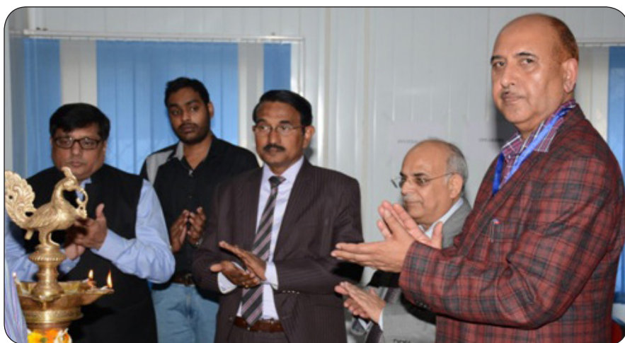
Lighting of the Lamp by the Chief Guest