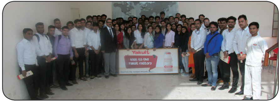
Management students at Industrial visit at Rai