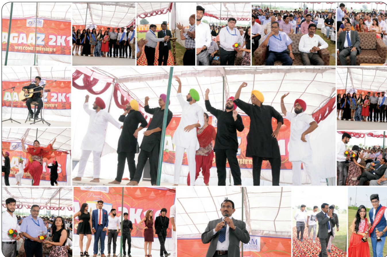
Glimpse of AAGAAZ-2K16

conducted with lot of fun zeal and enthusiasm. The event begun with warm welcome gesture and introduction of new batch and sharing their ambitious and goals to be achieved in life. Fresher's day events were hosted, conducted by the seniors batches of students