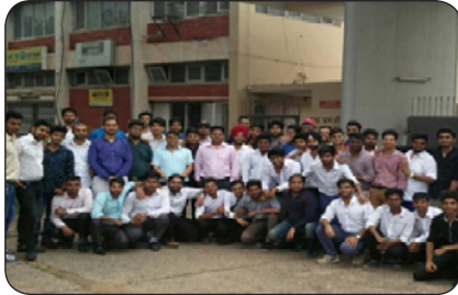
Our students of Mechanical Engineering at TATA Motors, Rudrapur, Uttarakhand

Department also organized two days Educational-cum-Industrial visit to Tata Motors, Rudrapur, Pant Nagar and Hydro Power plant Nainital on 30th & 31st March 2016 for 2nd Year Mechanical Engineering.