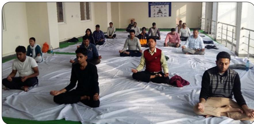
NSS Yoga Camp

SRM University Delhi-NCR Sonapat Haryana Conducted a five day yoga Camp under the NSS activities to celebrate Golden jubilee of Haryana state. The camp was organized in University Premises from 26th to 30th December 2016. The camp was attended by twenty five volunteers including faculty members and students of the SRM University Delhi-NCR, Sonapat (Haryana) under the guidance of well experienced teacher from Vayaktivikas Kendra. The participants learnt various Yogi's Kriya, Asana's, and Pranamaya useful to maintain Stress-Free, calm and peaceful routine in Daily life.