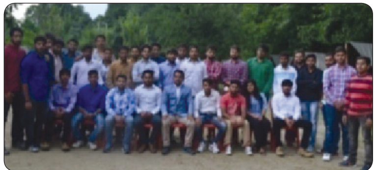
Civil Engineering Survey Camp at Manali, Himachal Pradesh