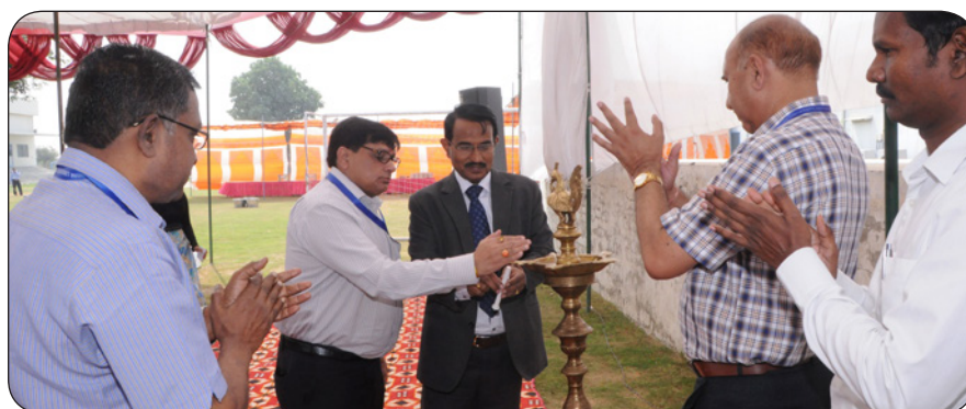
Inauguration of the Cultural Fest by the Hon'ble Vice Chancellor

SRM University Delhi-NCR Sonepat is a ragging free green campus. With the excellence in academics & research, we believe in nurturing the talent & groom the students in extra-curricular activities. Cultural Society of the students follows the footprint via organizing a Fresher's welcome under the banner "AAGAAZ-2k16". AAGAAZ-2k16 was held on 7th October, 2016 which was