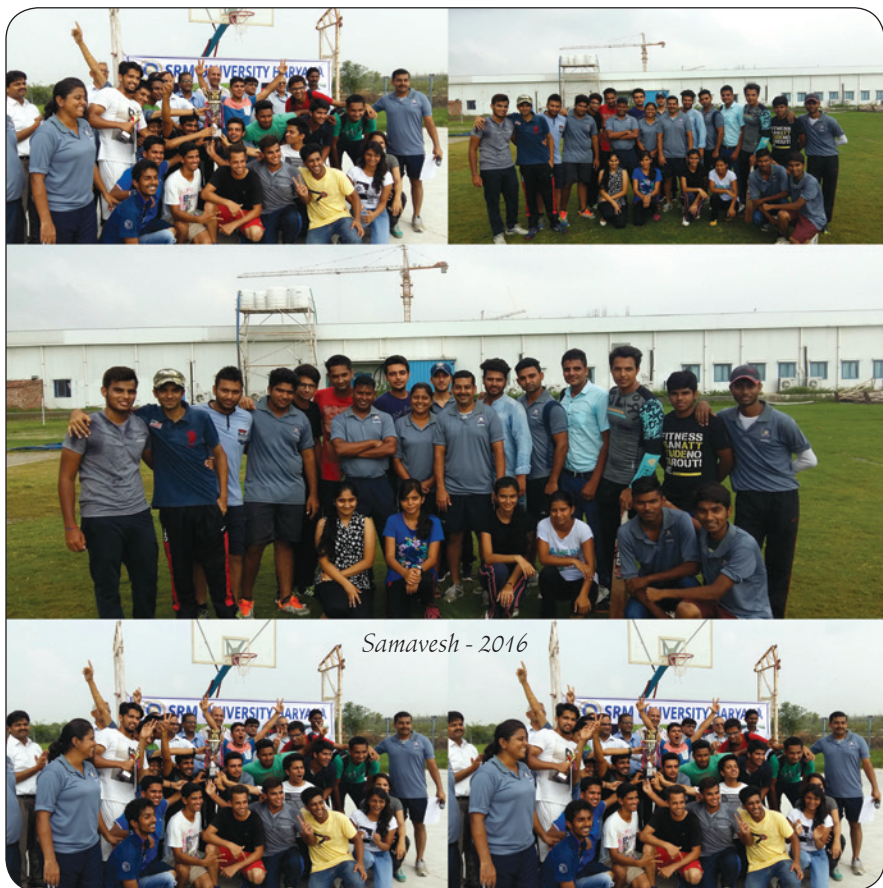
Samavesh - 2016