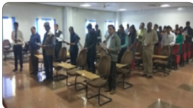
A view of the function

Constitution Day, also known as Samvidhan Divas is celebrated in India on 26 November every year to commemorate the adoption of Constitution of India. On this