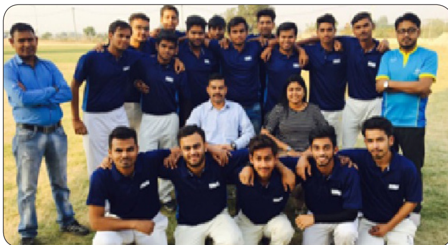
Our Cricket Team participated in AIU, Chaudhary Charan Singh University, Meerut

Sonapat, Haryana competed successfully in another All India Inter University Judo tournament for the year 2016 – 17. The event was organized by Kurukshetra University, Kurukshetra under the Guidance of AIU (Association of Indian Universities) from 3rd Nov – 6th Nov 2016.