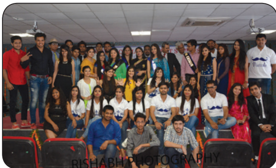
Our outgoing Management students in EXODUS 2016

Students coming and going is the legacy of any University where year after year new batches come and leave their footprints and set new benchmarks. Department of Management bid a successful farewell to their first Batch of MBA (2014-2016) students in the month of April 2016, called as "EXODUS". The students of Management organized various cultural events and wished their outgoing mates a great and rising career. Department and senior authorities congratulated students for successfully completing their academic curricula and achieving different heights and bright flying colours via getting placed in different public and private sectors.